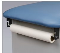
030– Paper Dispenser