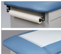
034– Paper Dispenser & Cutter Combo