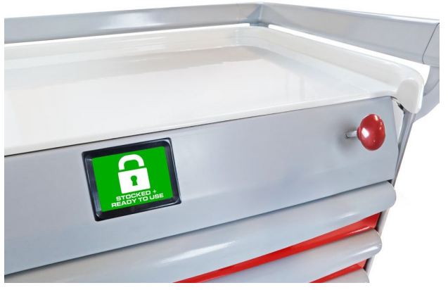
The green flag on the top panel indicates the cart is stocked, locked, and ready to use.

NOTE: The top drawer must be closed to lock all the cart drawers.