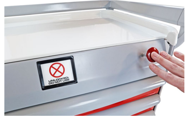
Pressing the Quick Release button instantly unlocks all drawers and changes the flag to a \otimes (to indicate the drawers are unlocked).

Firmly press the red Quick Release button to unlock all the drawers. The locked/unlock flag on the top panel will change to a \otimes (red X in a circle) and the message will indicate the cart drawers are unlocked.