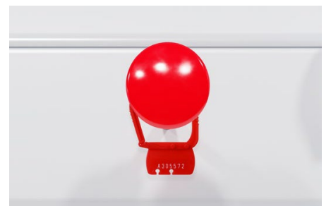
Quick Release button with optional breakaway plastic seal