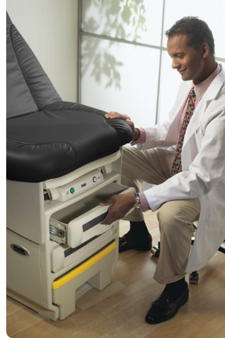
Ultra-Premium top option is more comfortable for your patients, giving your practice an exclusive feel and elevating your reputation.

The new look of your exam room is intended to promote overall improvement of your office environment through the 604's stylized design, featuring a plush, one-piece upholstered top. The 604 not only looks great, but is designed to be simple to clean. In addition, the 604 is user-friendly with a pneumatic cylinder designed to assist in easily placing the counterbalanced top in an infinite number of positions. Release handles on both sides of the top section are designed to make positioning easy.