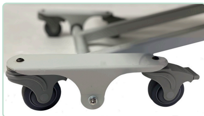
Optional Locking Twin Casters