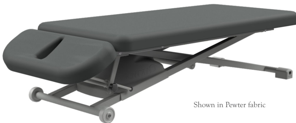
Shown in Pewter fabric