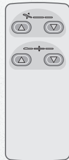
2219B Hand Remote